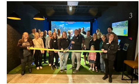
The Back Nine Golf - Hudson, WI - Located at 212 1 st St, Hudson. Enjoy Premium Indoor Golf at their 3-bay facility, with 24/7 member access and public tee times available each day. Welcome to the Hudson Area Chamber!