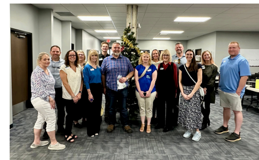
Ornament Shop - Located at 215 Monroe St N, Suite 401. They offer customization on ornaments to celebrate every occasion, and are able to create custom printed ornaments with your organization's logo. Thank you for your support of the Hudson Area Chamber!