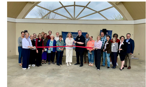
St. Croix Valley Opera - They are a non-profit organization designed to produce high-quality musical art performances for the bright and vibrant communities in and around the St. Croix Valley. They will be performing in Lakefront Park on Thursday, July 16! Welcome to the Hudson Area Chamber!