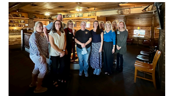
501 Tavern - Located at 501 6 th St N. They are a restaurant and bar with a rich history located in the heart of North Hudson. Join 501 Tavern for cribbage night, a cozy dinner, or consider their space for a special event. Thank you for your support of the Hudson Area Chamber!