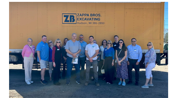
Zappa Brothers - Located at 715 6 th St N. They specialize in excavation and site preparation as well as repairs, road work, septic removal, and digging. Thank you for your support of the Hudson Area Chamber!