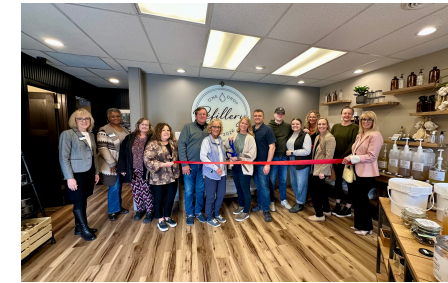
One Drop Refillery - Located at 759 Sommers St N, Hudson. They are a new refill shop designed to help families simplify healthy and sustainable living through non-toxic products and reusable containers. Welcome to the Hudson Area Chamber!