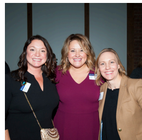
Get connected and meet new members! Attendees have the opportunity to promote their business, hand out business cards, and network with other local leaders.

Date: Tuesday, July 9, 2024 | Time: 9:00 a.m. Location: Citizens State Bank | 375 Stageline Rd To register, click here .