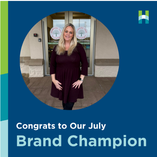
Congrats to Our July Brand Champion